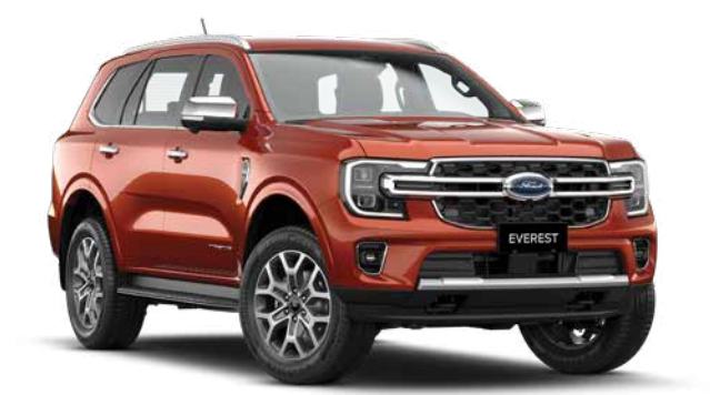
The perfect combination of luxury and capability