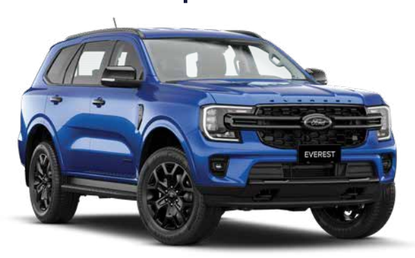
Ready to take you on adventures and look great doing it