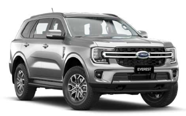
Capable and comfortable, smart and purposeful