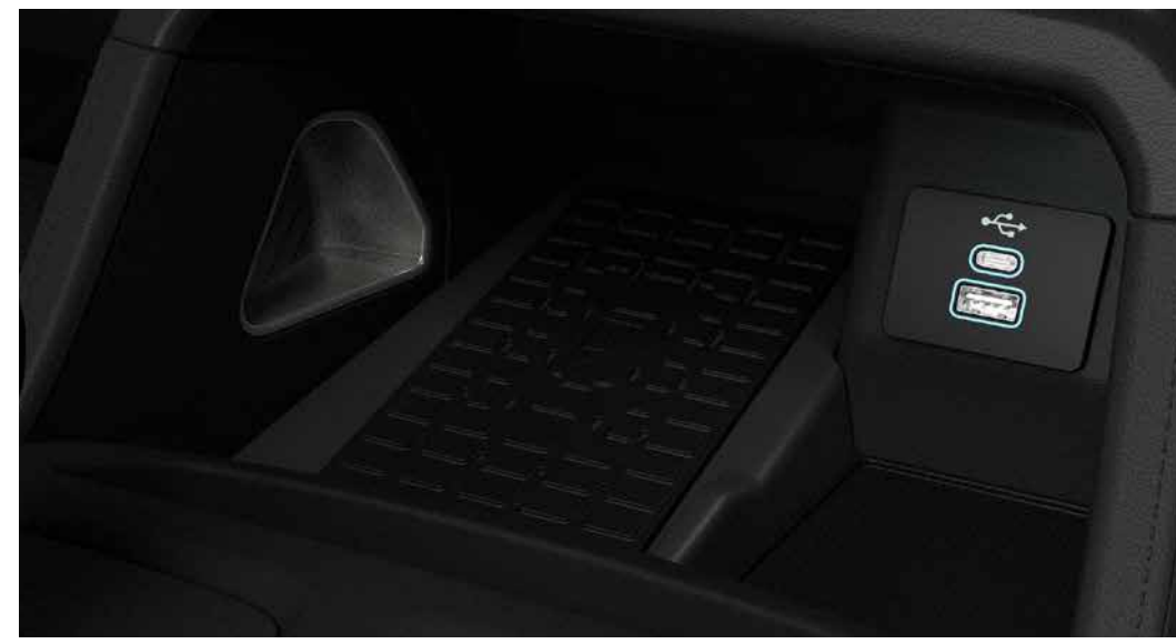
Wireless Charging Pad<sup>3</sup>

SYNC®4A is a cloud-connected in-vehicle communication and entertainment system. There's a host of features, made easier by the system showing your last 5 actions. The information cards are simple to navigate using intuitive gestures. With wireless smartphone integration, and a 10.1" or best-in-class 12" touchscreen, you'll experience a whole new world of connectivity through your vehicle.