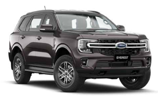
Ruggedly stylish, smart and safe, and ready for it all